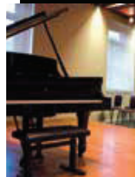
Mikowsky Recital Hall