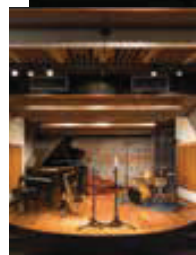
Miller Recital Hall