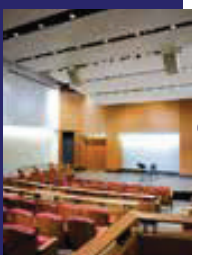
Miller Recital Hall