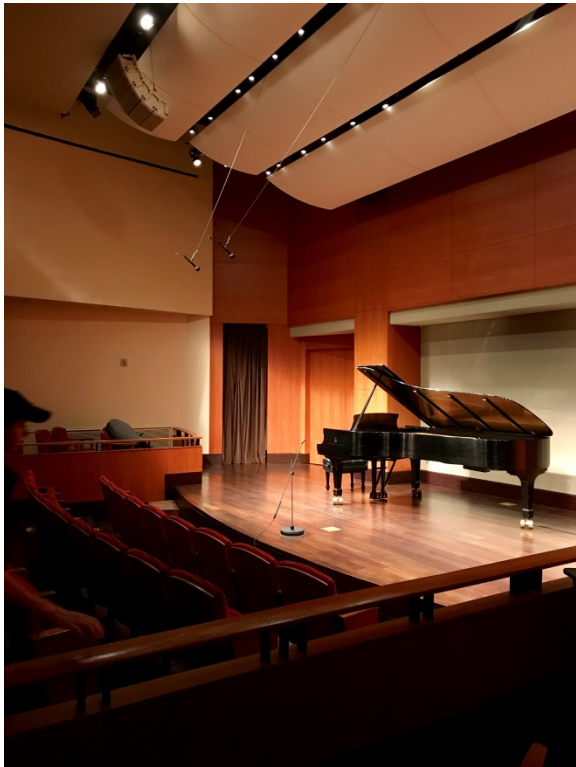
Miller Recital Hall stage seen from the house right box seats