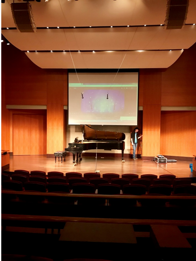
Miller stage with piano at center and projection screen extended