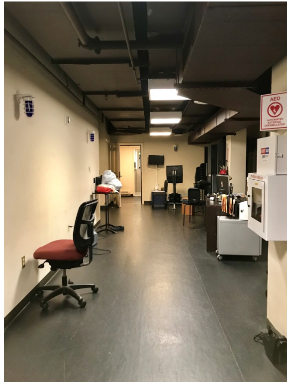
Backstage Miller (upstage cross, with dressing room at the far end)