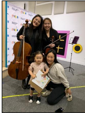
Strings Concert at Children's Museum of Manhattan (2024-2025)