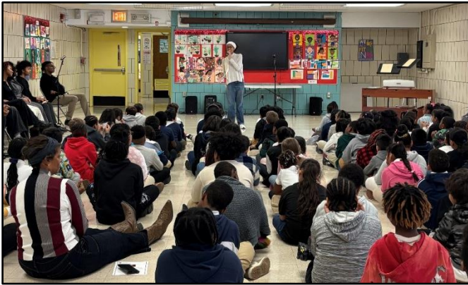
BSU Concert at P.S. 36 (2024-2025)