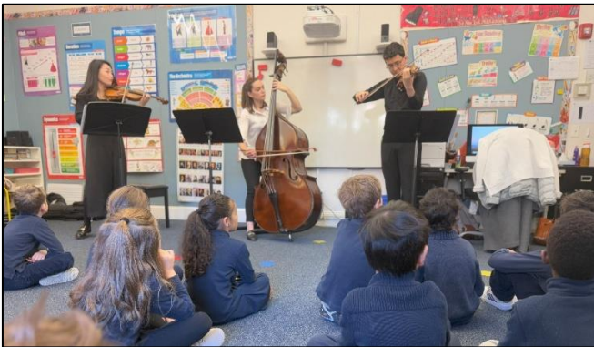
Strings Demonstration at The Cathedral School (2024-2025)