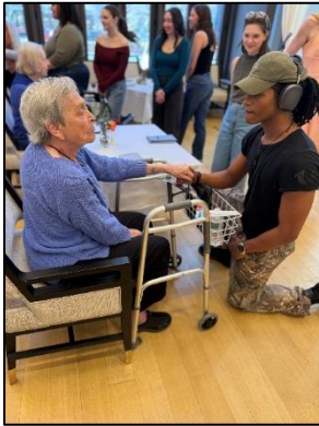
Freshman Pops Concert at The Apsley (2024-2025)